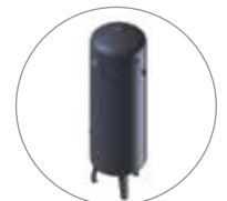
Oxygen buffer vessels