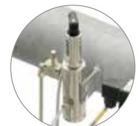
PDP sensor kit