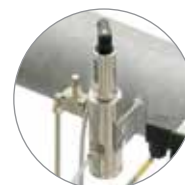
Outlet PDP sensor