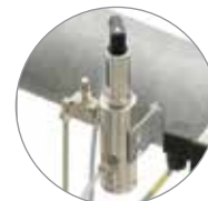
PDP sensor kit