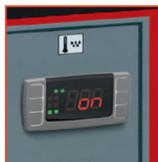
Dew point indicator

It discharges only water. No noise! Available in the whole range.