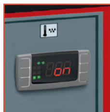
Dew point indicator

It discharges only water. No noise! Available in the whole range.